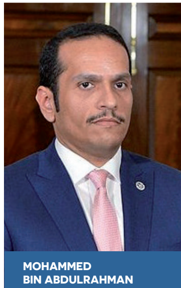
MOHAMMED BIN ABDULRAHMAN BIN JASSIM AL-THANI Deputy Prime Minister and Minister of Foreign Affairs, Qatar