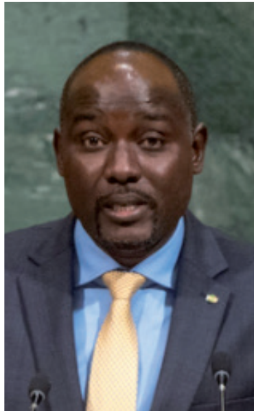
IBRAHIM YACOUBOU Minister of Foreign Affairs, Niger