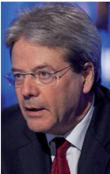
PAOLO GENTILONI President of the Council of Ministers, Italy