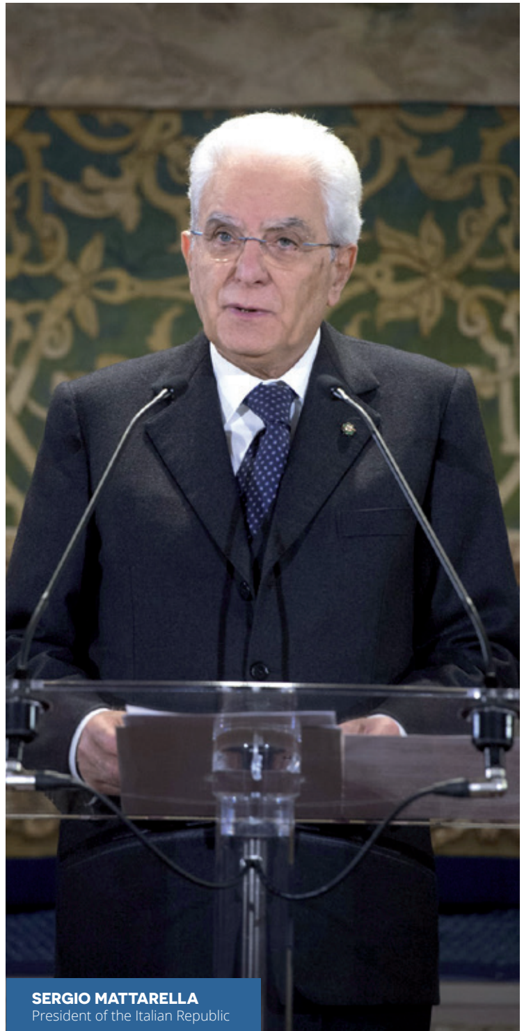
SERGIO MATTARELLA President of the Italian Republic