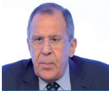
SERGEJ LAVROV Minister of Foreign Affairs, Russia