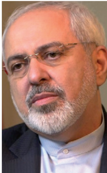
MOHAMMED JAVAD ZARIF Minister of Foreign Affairs, Iran