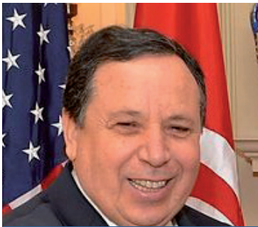
KHEMAIES JHINAOU Minister of Foreign Affairs, Tunisia