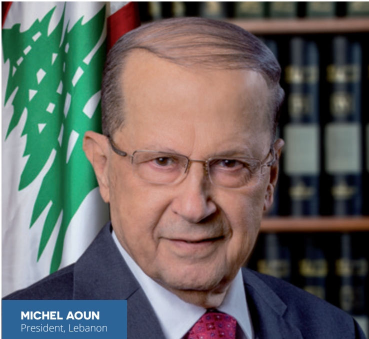
MICHEL AOUN President, Lebanon