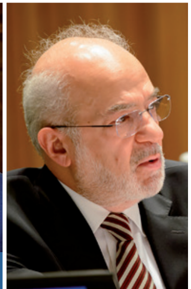
IBRAHIM AL-JAFAARI Minister of Foreign Affairs, Iraq