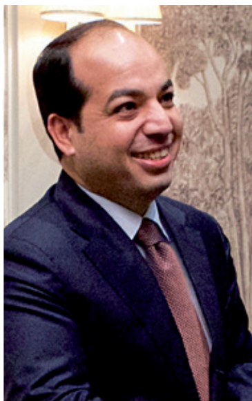
AHMED OMAR MAITEEG Vice President, Presidential Council, Libya