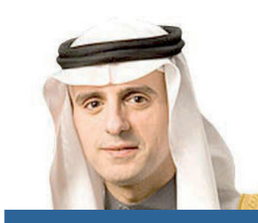
ADEL AL-JUBEIR Minister of Foreign Affairs, Saudi Arabia