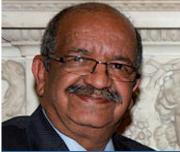
ABDELKADER MESSAHEL Minister of Foreign Affairs, Algeria