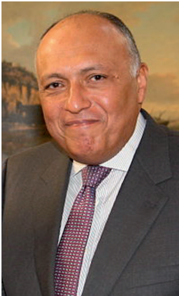
SAMEH HASSAN SHOUKRY Minister of Foreign Affairs, Egypt