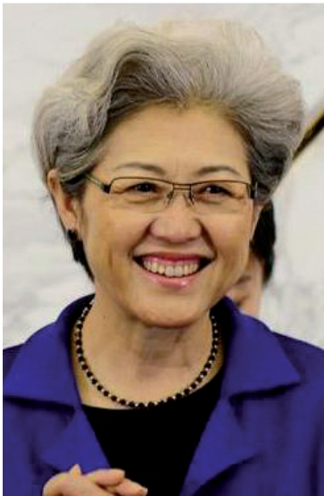
YING FU Chairperson of the Foreign Affairs Committee, National People's Congress, China