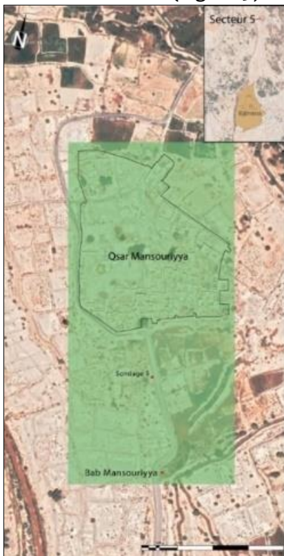
Figure 2 : Sijilmassa site (Secteur 5)