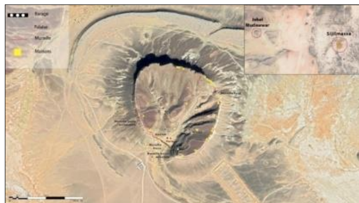
Figure 3 : Al-Mudawwar site (Secteur 6)