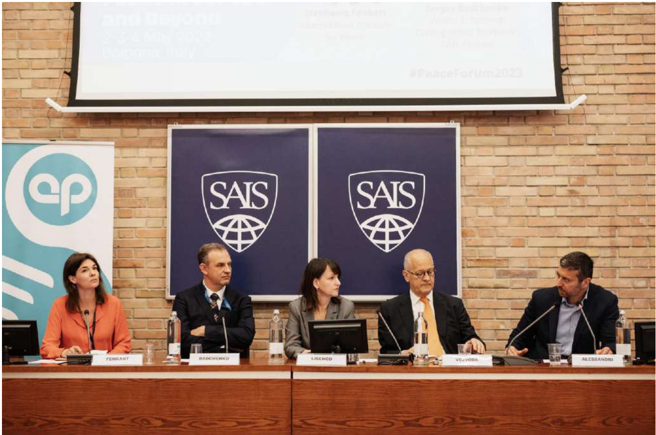
First panel speakers.