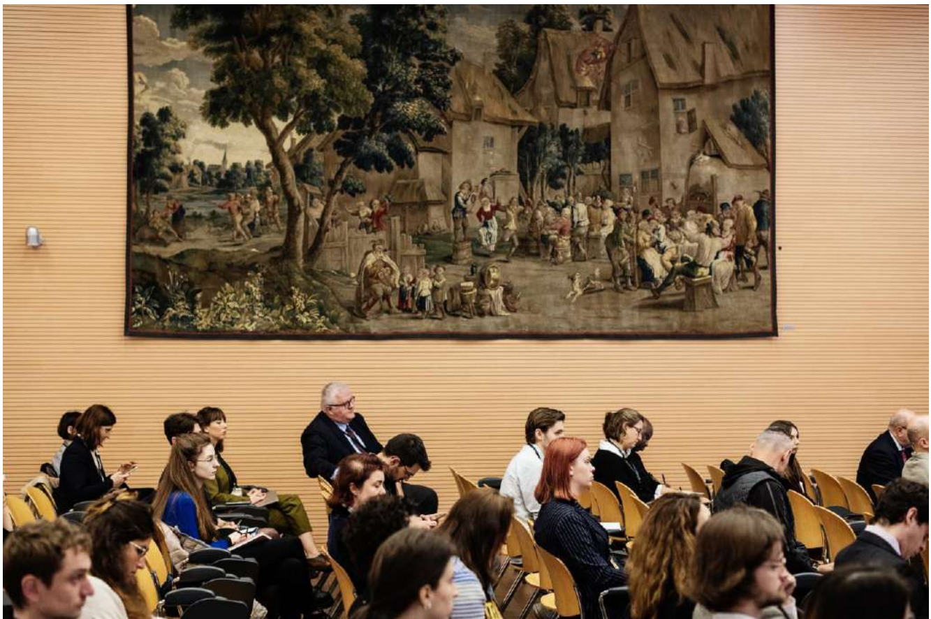
Participants listening to the second session.

The EU is one of the biggest actors for peace in the world and it is investing in Africa to support infrastructure, social growth, and security. At the same time, Pondeza argued that we can observe a sort of competition coming from other actors who are now investing in Africa (such as Russia and China). However, first, we should pay attention to how each group is contributing to the economy of peace; second, we should take into consideration that neighbouring countries making blocks within the African Union (AU) may not support each other. This may be an interesting reflection connected to what is going to happen with major groups in the world.