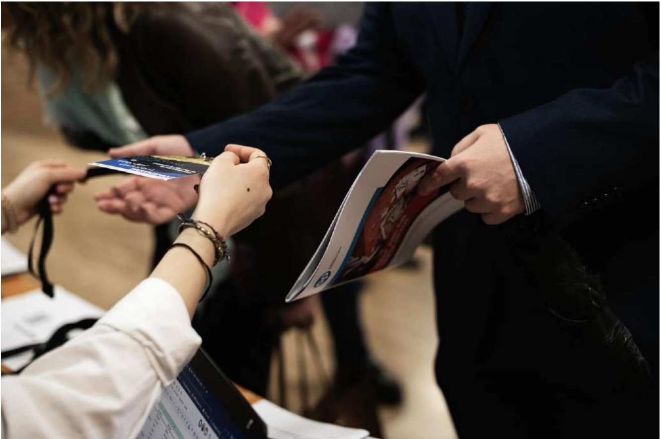
Forum registrations (Credit: Rosa Lacavalla/ AP).

The war in Ukraine has generated an impressive disruption in Europe and its effects are re-shaping global peace and security governance. Peace advocates have had to reconcile solidarity toward Ukraine and a call for diplomatic solutions. International organisations, from the Organization for Security and Cooperation in Europe (OSCE) to the United Nations (UN), have struggled to find their role in the crisis and have remained marginal so far. This marginality could reshape the global multilateral peace and security system. At the same time, the European Union (EU) has clearly defined its position and role. Yet, its choices will affect its financial and political capacity to build partnerships with countries from North Africa to Southeast Asia, from the Caucasus to Southern Africa. New multilateral formats are under discussion or taking shape, such as the European Political Community that gathers the countries of the Eurasian continent. The Forum provided the opportunity to analyse these scenarios and possible future trajectories, including how civil society organizations (CSOs) and societies are adapting and which role they can play in the future. The Forum also discussed how the ongoing war in Europe has impacted the rest of the world and the EU's capacity and instruments to work for peace abroad.