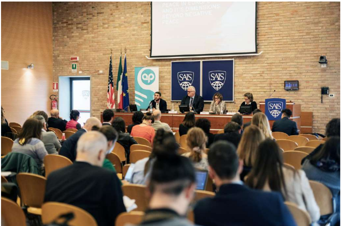
Speakers of the third panel (Credit: Rosa Lacavalla/ AP).

According to Stroobants, what is left to do then is to invest in positive peace and avoid ignoring the need for systemic changes. He calls for Europe to diversify investments, formulate realistic contingency plans, and increase strategic security analyses. Above all, he urged Europe to accept and adapt to these changes, and actively build peace in its surrounding regions and peripheries, because if it fails to do so the existence of the EU could be jeopardised.