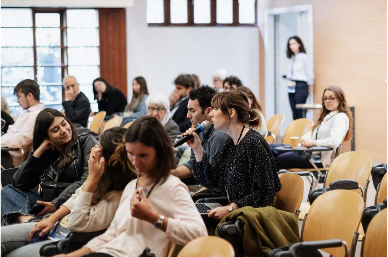
Q&A time during the second session (Credit: Rosa Lacavalla/ AP).

circumstances, local actors are keeping a low profile. In conclusion, Saeed recalled that anybody dealing with peace needs to concentrate on all the elements of accountability including community restoration, restorative justice, gender justice, and international support to local initiatives.